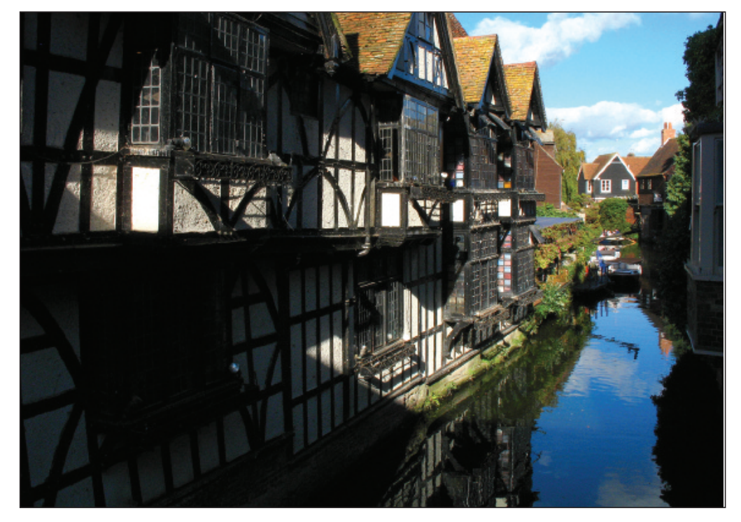
The Weavers' House.