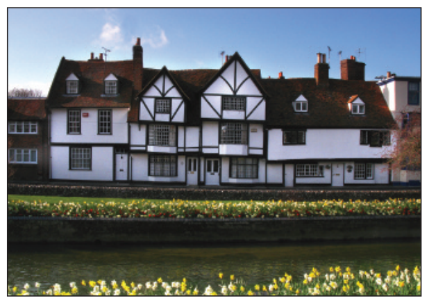
Daffodils by the River Stour.