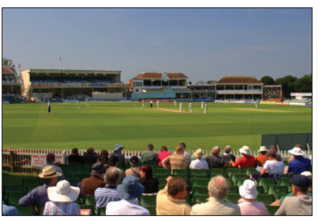
St Lawrence Cricket Ground.